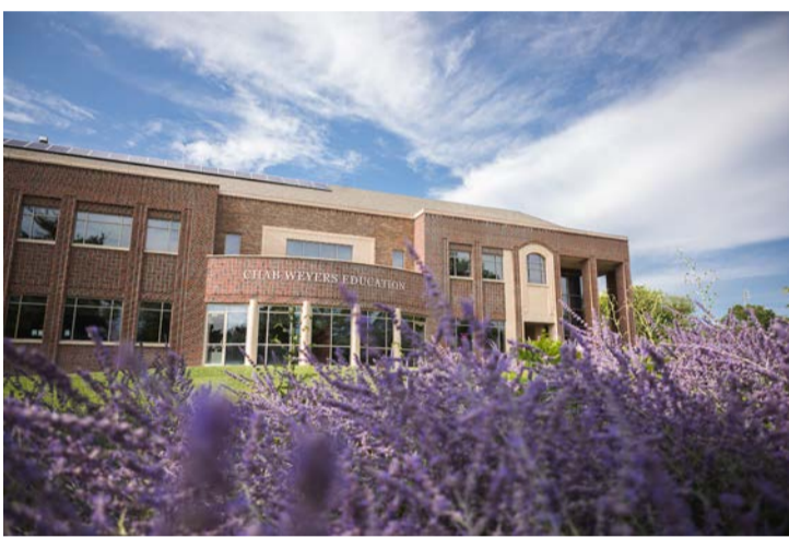
The lavender in front of the Chab Weyer Education and Hixson-Lied Art Building looked fabulous this summer!

We're considering an all staff assembly and want your thoughts! Before the start of the academic year, Faculty Council leads Fall Faculty Days, which includes presentations on different subjects. We want to know — is there something you can speak to that would benefit all staff members? Is there something you want to know more about? Reply to this email with suggestions!