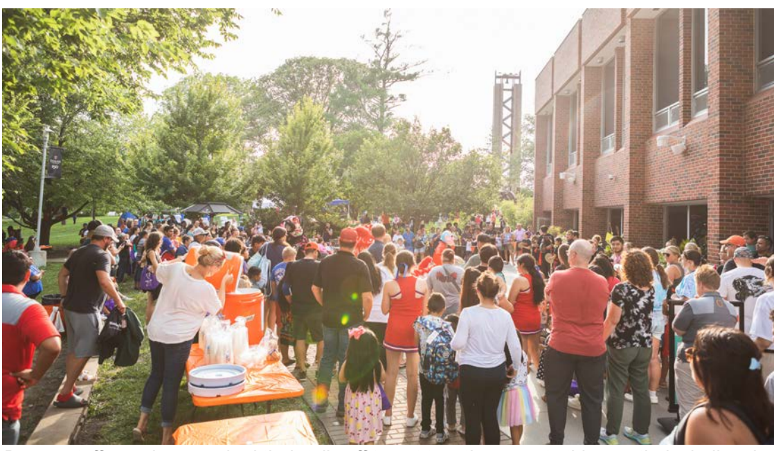
Doane staff members worked their tails off to put together events this month, including the Back to School Community Picnic (pictured above) and move-in days.